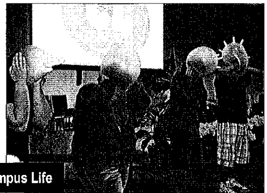
Blowing their minds at Campus Life