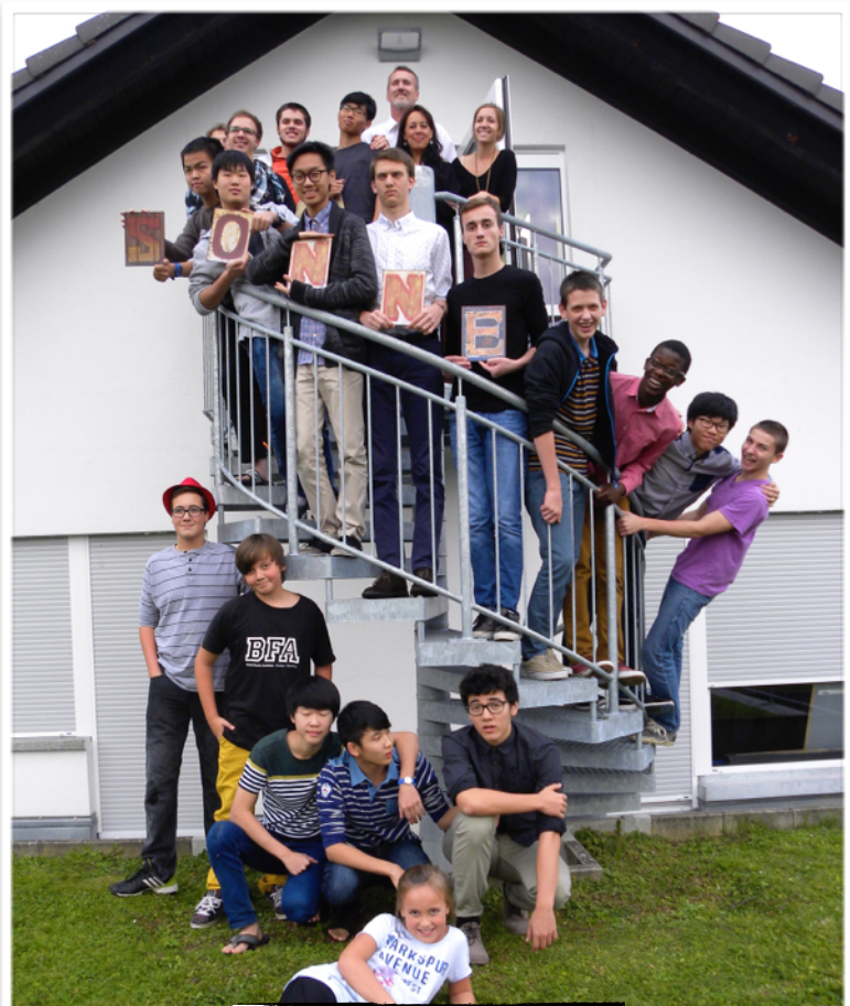
The whole Sonne Dorm

Dorm Thanksgiving is celebrated halfway between Canadian Thanksgiving and American Thanksgiving. Thus, last Sunday I was invited to delicious dinners at Sonne and Maug. Not only was the food fantastic, but I was also blessed by sweet fellowship with the dorm staff and students. It was very special to hear about things that our students are thankful for and to hear more about their very unique backgrounds. I was encouraged to remember that amidst the busyness of a very busy school year they are why I am here. I am here to pour into their lives and to be a part of their family away from family. Please pray that the Lord would continue to give me energy and love to invest in these very special third culture kids.