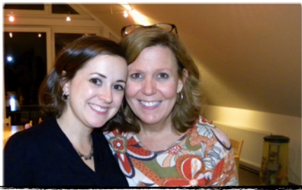
Love serving with this dorm mom!